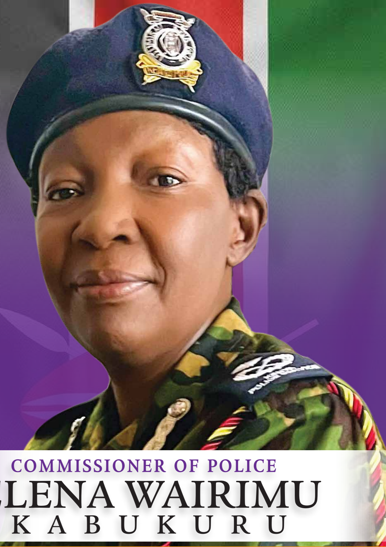
COMMISSIONER OF POLICE ELENA WAIRIMU K A B U K U R U

Celebration of Life 24 th Feb, 1965 - 14 th April, 2023